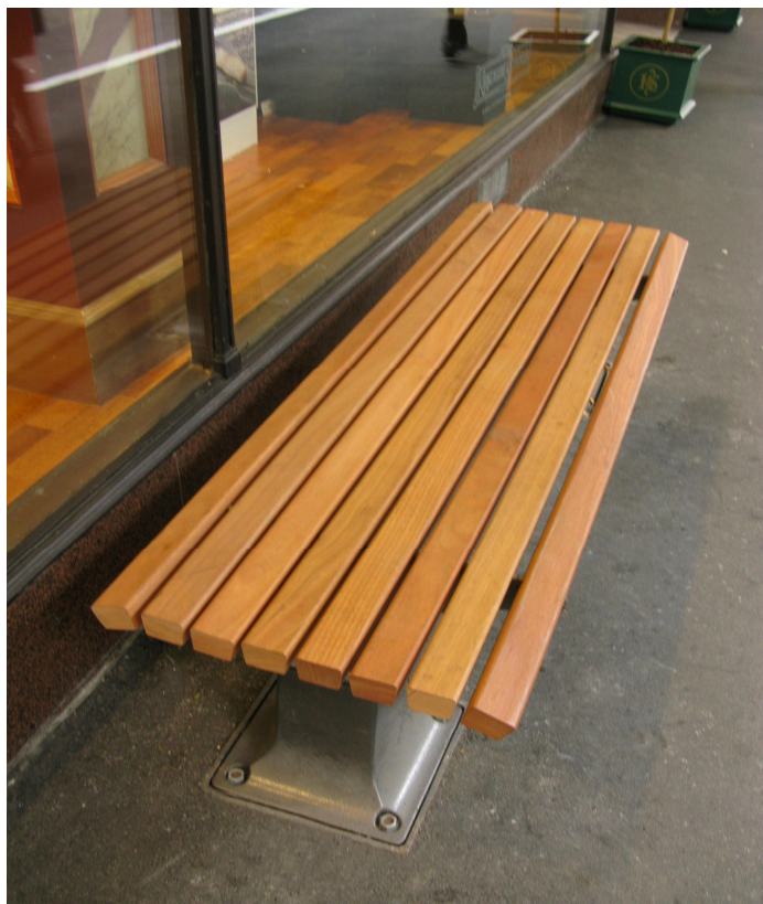
Golden Mile Bench outside Kirkcaldie & Stains, Wellington

Where high quality public seating spaces need to be maximised in a city street or mall environment, the classy Golden Mile Bench is a practical option that will give many years of service.